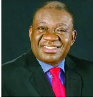
Prof. Chinedu Nebo , FNSE, CON, NPOM Former Minister of Power, Nigeria Board Chairman